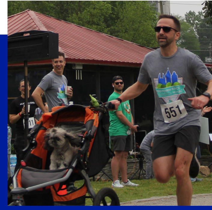
2024 Sponsorship Package