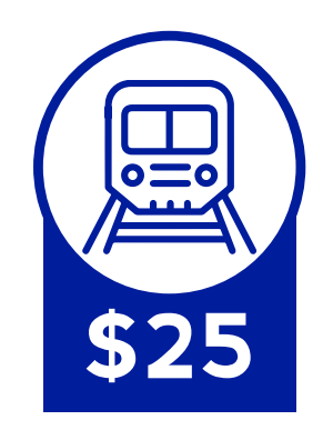
Transportation to Work

Many of the people MAC helps are those upon whom we depend to provide services to us in the retail, hospitality, security and construction industries. Often, this population lives at the edge of poverty. MAC is often the only safety net that stands between these hard-working men and women and homelessness.